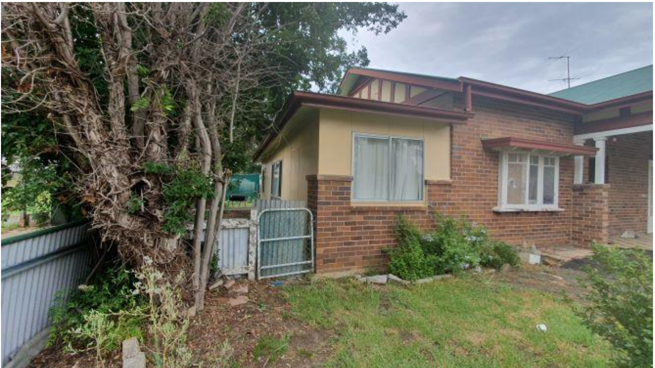
Above: This image shows the 'closing in' of the side porch of the bungalow (post-1986). An extension has also been made to the rear of the bungalow, shown below .